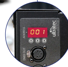
Digital DMX Interface