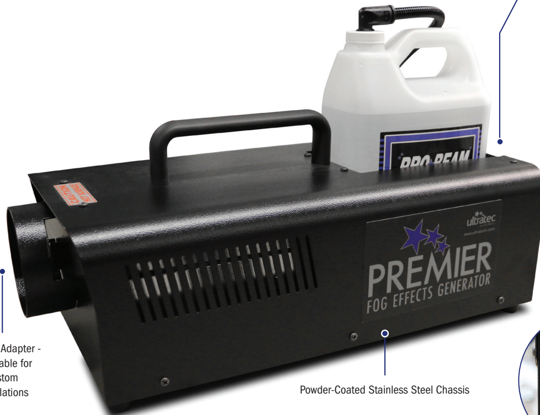
4" Hose Adapter - removable for custom installations