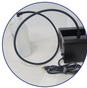
Premier Industrial Hose