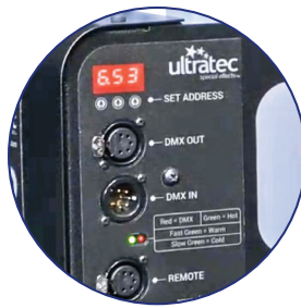
Built in 5-Pin DMX/RDM