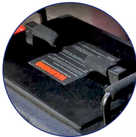
Heavy Duty Latches