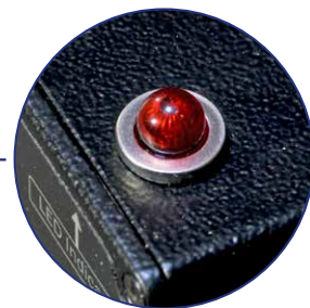
Low Water Shutoff Indicator