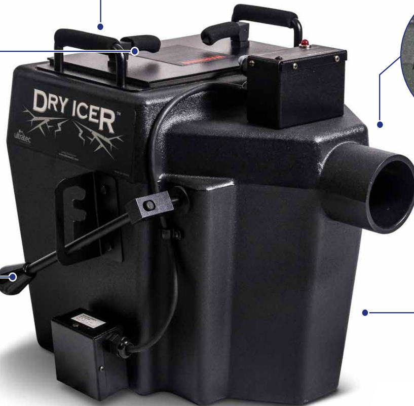
3 Step Pivoting Ratchet System