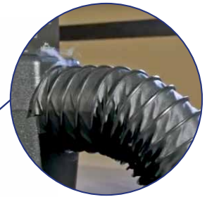
4" Hose Adaptor (can be used with optional 25 ft. flex hose)