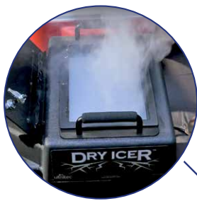
20 lb Dry Ice Capacity